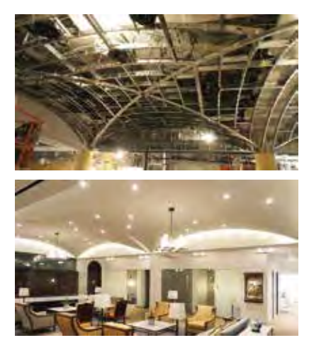
Church Pension Group , NY, NY Architect: Beyer Blinder Belle Architects Acoustical Consultant: Acoustic Dimensions

The vertical suspension for the above framing systems should be rigid, and sometimes will require bracing or kickers.