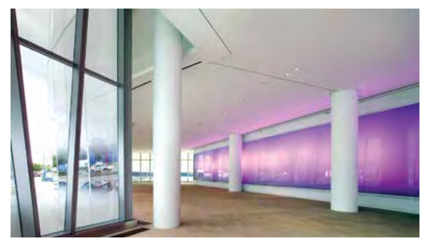
IAC, NY, NY Architect: Frank O. Gehry Partners / Studios Architecture Acoustical Consultant: Shen Milsom Wilke

The StarSilent system utilizes a sound panel that is composed of up to 96% post-consumer, recycled crushed glass bottles. The plasters are composed of 50% recycled marble aggregate. The panels are attached to rigid metal framing with zinc coated drywall screws. The edges of the panels are glued together using a special adhesive, which is also spread over the screw heads. After light sanding, the panels are first coated with a base coat plaster that requires a minimum of 36 hours to dry. The finish coat plaster is then applied to achieve a smooth, seamless, sound absorbing plaster wall or ceiling.